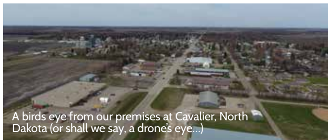
A birds eye from our premises at Cavalier, North Dakota (or shall we say, a drone's eye...)

We are currently preparing for the Regina Farm Progress Show which will kick off the busy farm show season. In August, look out for us at FarmFest in Redwood Falls MN, Empire Farm Days in Senaca Falls NY, Farm Progress Show in Decatur IL - we look forward to seeing you!